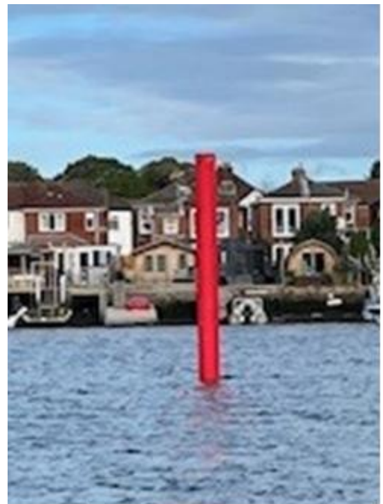
Wreck pile #2