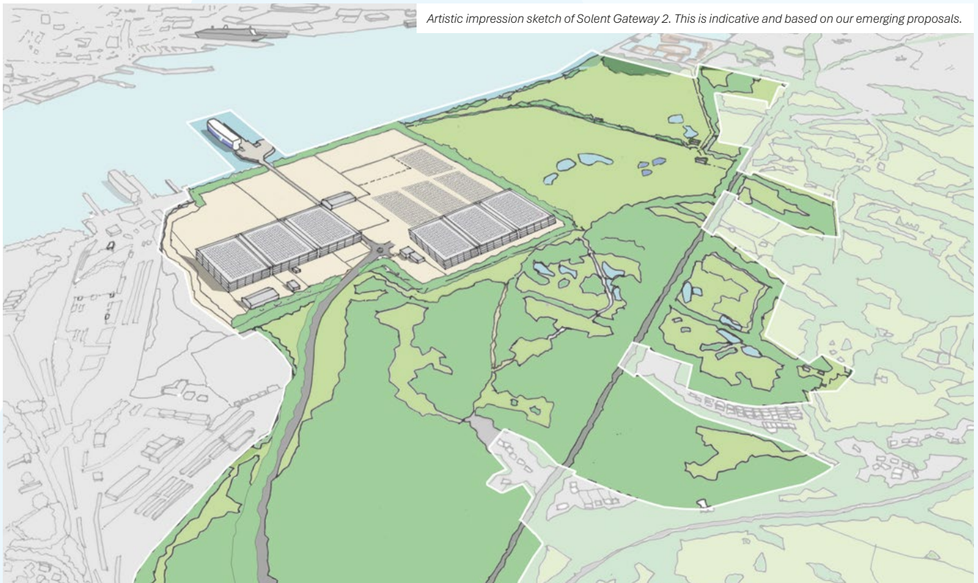
Artistic impression sketch of Solent Gateway 2. This is indicative and based on our emerging proposals.